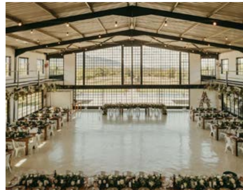
Industrial styled reception Outside chapel area